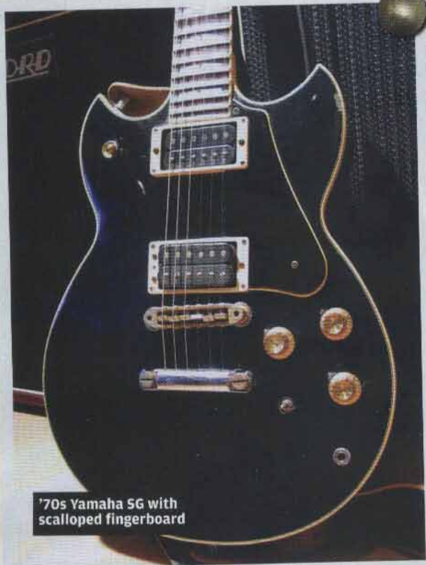
'70s Yamaha SG with scalloped fingerboard