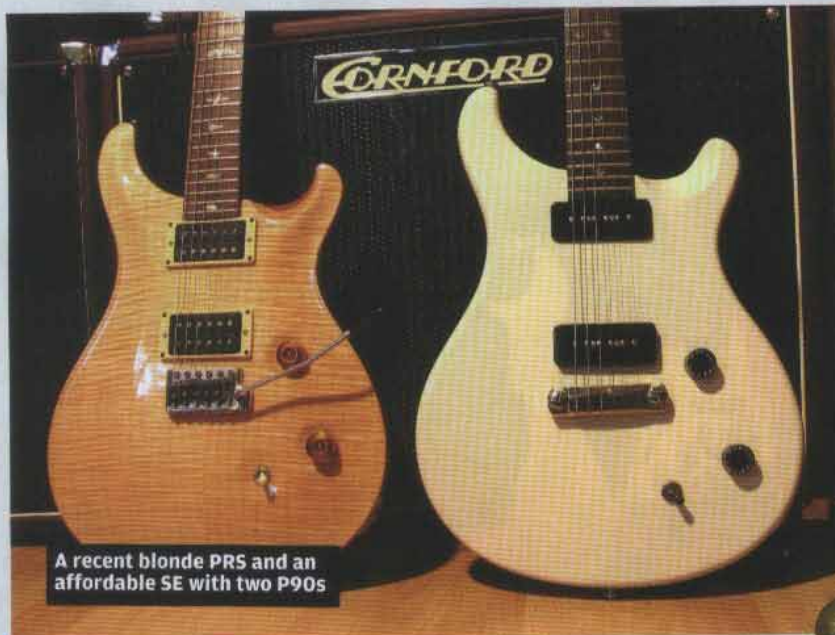
A recent blonde PRS and an affordable SE with two P90s

'People think you just get free guitars, but that's not what it's about,' he advises. 'I've actually sent a PRS prototype back as there were several problems that needed to be rectified, and it just didn't work ☹'