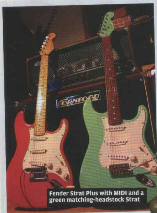
Fender Strat Plus with MIDI and a green matching-headstock Strat

'But I was really impressed with this PRS SE with P90s. I can almost see a parallel between this and the Les Paul Juniors, which were really student guitars. I've recorded many hours with this one, and it's a lot of guitar for the money.