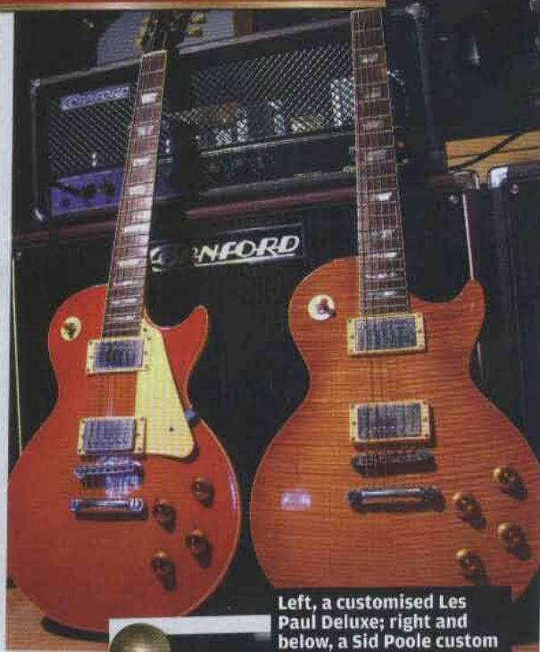
Left, a customised Les Paul Deluxe; right and below, a Sid Poole custom