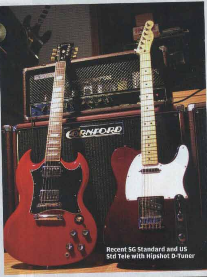
Recent SG Standard and US Std Tele with Hipshot D-Tuner