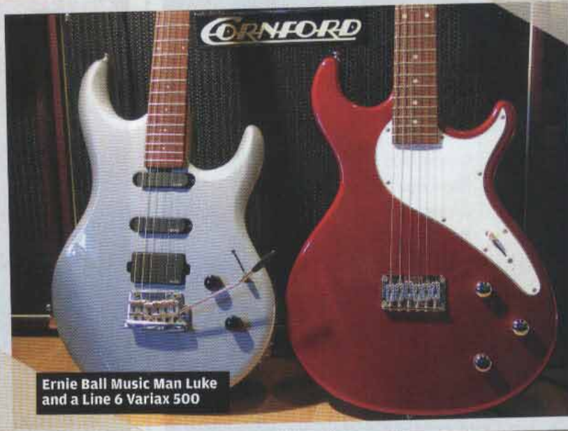
Ernie Ball Music Man Luke and a Line 6 Variax 500

'I also picked up this Tele with a drop tuner over the net, and this amazing little