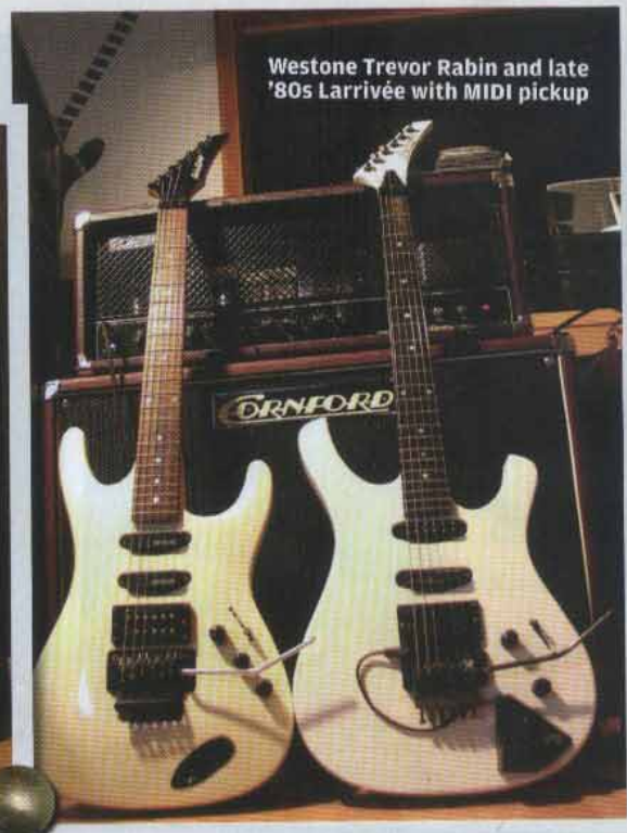
Westone Trevor Rabin and late '80s Larrivée with MIDI pickup