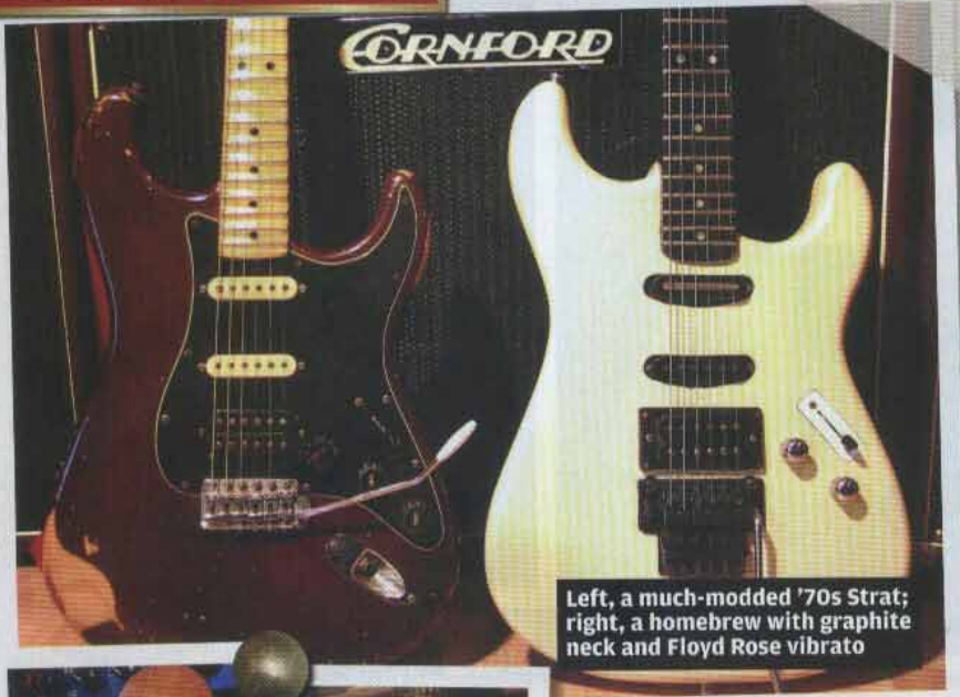
Left, a much-modded '70s Strat; right, a homebrew with graphite neck and Floyd Rose vibrato